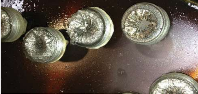
Contamination captured by magnetic plugs.

After 500 hours on new fluid, analysis showed ISO code increases to 25/23/18 with iron concentration at 250ppm or more.