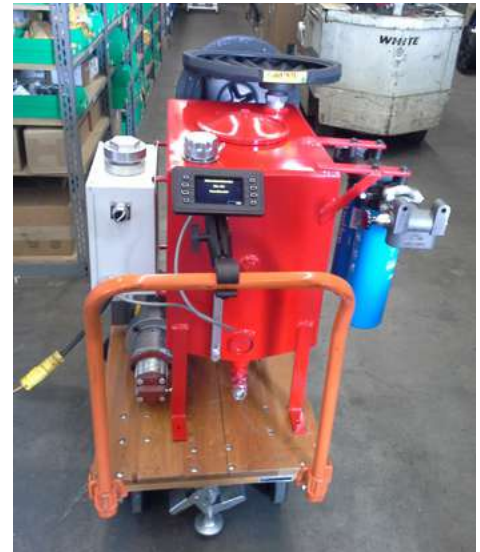
Kidney Loop Cart with Donaldson Blue DBB8665 filters.

Each rear wheel assembly on a haul truck represents cost of $250,000 or a replacement cost of $600,000 USD. According to General Electric*, the estimated expected life of a rear wheel motor is 24,000 hours. In order to achieve or surpass that life, fluid cleanliness is essential. Fluid that does not meet the specification for contamination, water, and wear metals like iron must be drained and replaced.